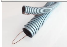
Photo. 3,4 RKSGHF made of PC 750 N without and with guide wire